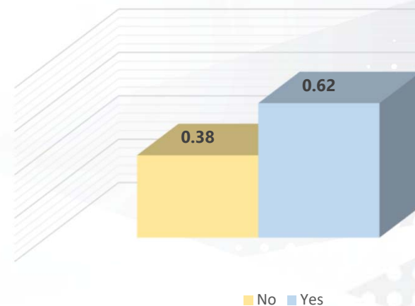
Early College Sign Up